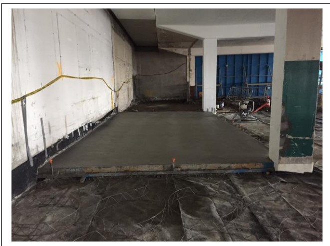
Concrete slab commenced to the undercroft of the viaduct