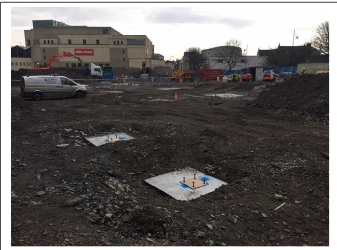
Zone 1 & 4 pad foundations being prepared and poured.