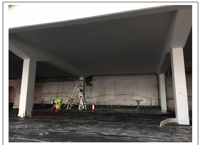
Completed decorative sample of the viaduct soffit.