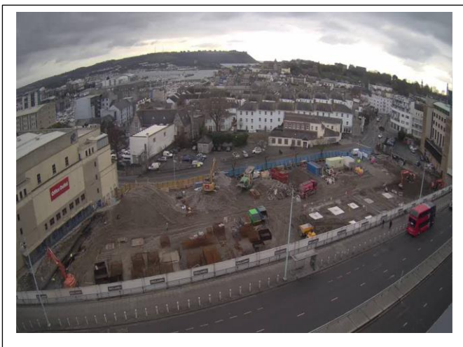
View from the Primark rooftop webcam.