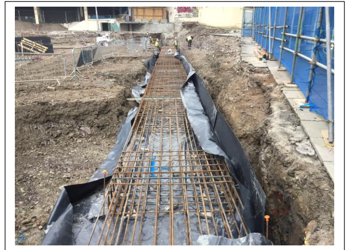
Steel work preparation to a retaining wall by Gala Bingo.