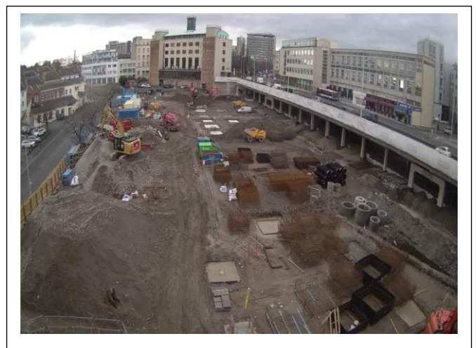
View from the Staples rooftop webcam.