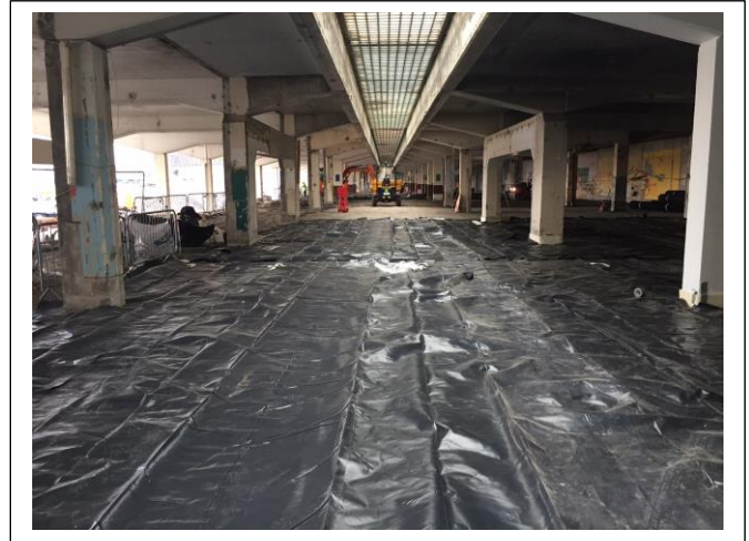
Preparing undercroft for concrete slab.